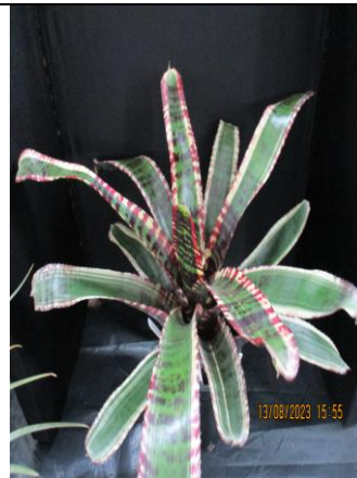
Neo 'Black Opal' Well grown & good markings