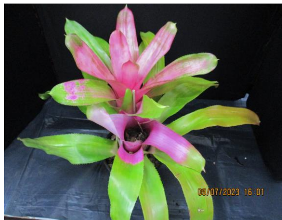
Neoregelia "Pink Sensation"