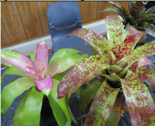
Sport of Neo 'Justins Song' with Neo 'Justins Song'

There was discussion on the sport of 'Justins song' with more questions than answers! 'Sport' is a natural vegetative off shoot from mother not the same as and offsets can be unreliable.