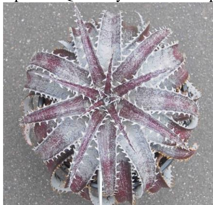
MLxA on the label indicates the cross between Marnier Lapostollei and Arizona.

Dyckias grown from seed update by Julie, as usual well grown and the cold weather is bringing the colour out. (see other photos Quarterly Vol46 No 3 page 2)