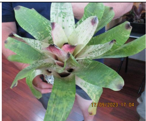
V. 'Love Bug'