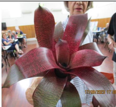
V. 'White Diamond' x V. 'Hawaiian Ruby'