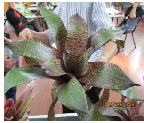
V. 'Zebra' x V. 'Hawaiian beauty'.