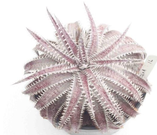
A cross between Marnier Lapostollei and Arizona.