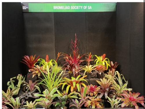
Our display

Our display was again very colourful & eye catching thanks to Adam however the location was disappointing.