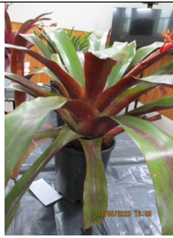
Aechmea 'Shining Light' Flower lasts for several months