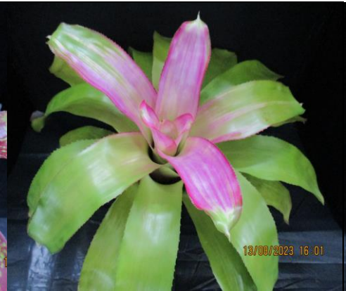
Sport of Neo 'Justins Song' from same mum

Also on the tables Neo 'Spot on', well named looks like spots painted on. Good light will increase colour. Neo Johannis grown in open garden with full sun.