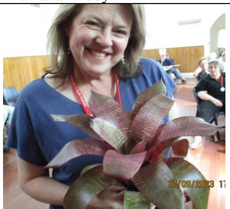
V. 'Texas Rose'