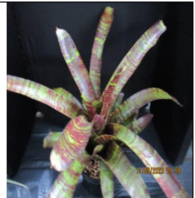
Neo 'Chantini x moon over fort dix' Very susceptible to cold & will deteriorate quickly in wet & cold

There was discussion on the sport of 'Justins song' with more questions than answers! 'Sport' is a natural vegetative off shoot from mother not the same as and offsets can be unreliable.