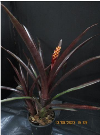
Aechmea. Black on black Inflorescence nearly same as leaves

Members were delighted with the variety and colour that was on display especially for this time of the year here in Adelaide.