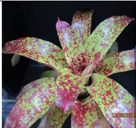
Neo 'Justins Song'