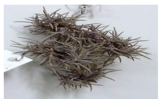
T. capillaries 'Pitchfork'