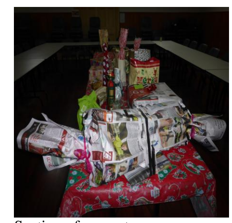
Section of presents

After an enthusiastic vote from those present this event will be included on our 2017 calendar. Bev