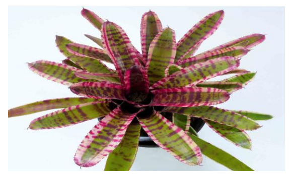
Neo 'Blushing Zebra'