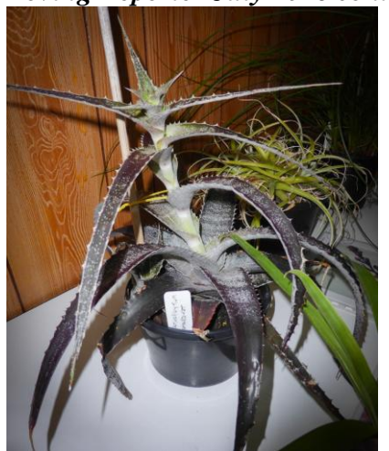
Orthophytum 'Stardust'

The plant theme was 'Uncommon genera' which is difficult to cover when you realise that what is uncommon one year is common the next. So you do not see much new stuff for the likes of myself to get out the books of reference to investigate identity and find out if such Bromeliad has a story to tell. One photograph that did catch my eye was Orthophytum 'Stardust'. This is one of the easier to grow in Adelaide because it puts out a long peduncle (stem) before flowering. I say easier to grow because it is not a shadehouse plant used to all weathers. The ones that do not have a peduncle would only survive in a heated glasshouse in Adelaide although the bigeneric Neophytum does quite well here. As I understand it this group may well be transferred to its own genus. One annoying factor with the long stemmed ones is that an offset seems to have that urge to flower when they look better at the juvenile stage!