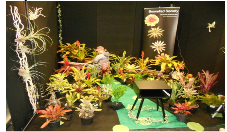
Our display from one angle

After many years absence our Society again