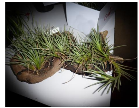
Tillandsia albertiana

I brought in 3 plants that I thought were somewhat unusual and I understand they were auctioned so the recipients have what I call a challenge. The first was a set of Tillandsia albertiana which I am fairly certain has the right name.