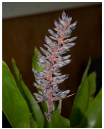
Aechmea 'Que Sera'