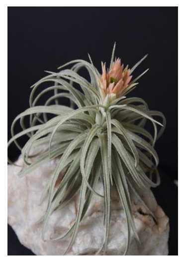
Tillandsia mauryana

I must mention Julie's Tillandsia mauryana which she had flowered. You may think that a green petalled plant would not be spectacular but you must remember that a Brom grower should always be on the lookout for something different. She had even been doing some studying because she had her plant attached to a rock. It has never been reported up a tree or in a bush in the wild.