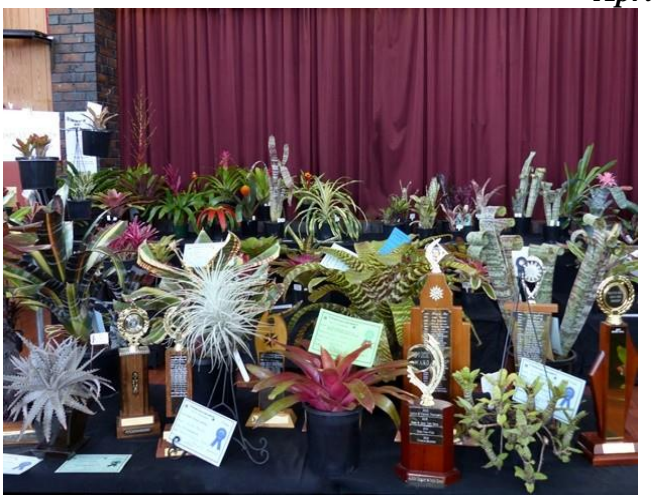
Trophy winners

Saturday morning was not the usual long queue waiting at the door; however there was a steady stream of people coming through the door for most of the day resulting in very good sales. Sunday was very slow similar to previous events