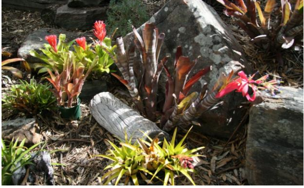
Another flowering in rock garden

In another article I identified our rock garden which was open to all of the elements, got lots of tatty leaves with sunburn; however produced lots of flowers, lovely leaf markings etc.