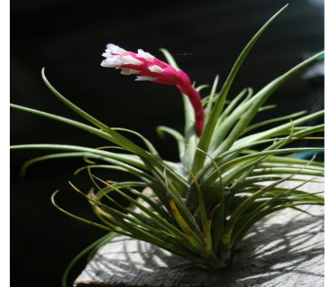
Tillandsia. tenuifolia 'Emerald Forest'