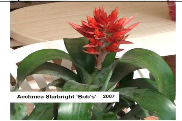
Original Aechmea Starbrite, commercial flowered.

flower spikes from the lower leaf axils. (Perhaps its something in the air from OneSteel?)