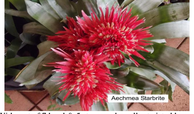
With part of 7 head & 5 stems and smaller twisted leaves