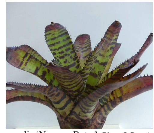
Neoregelia 'Norman Bates'