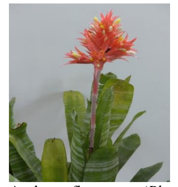
Aechmea flavorosea

I understand there was a discussion as to links between the exhibited plant Aechmea flavorosea and Aechmea nudicaulis because of the thumbprint between leaf sheath and leaf blade. The botanist will tell you no. You look for similarities or differences in the sex parts (the flower) which goes back to Linnaeus times. This does not mean there was no controversy because