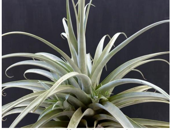
Normal offsets