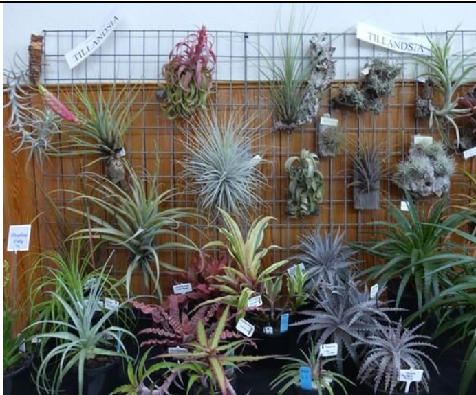
Tillandsias on display