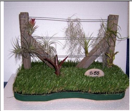
Log & wire fence