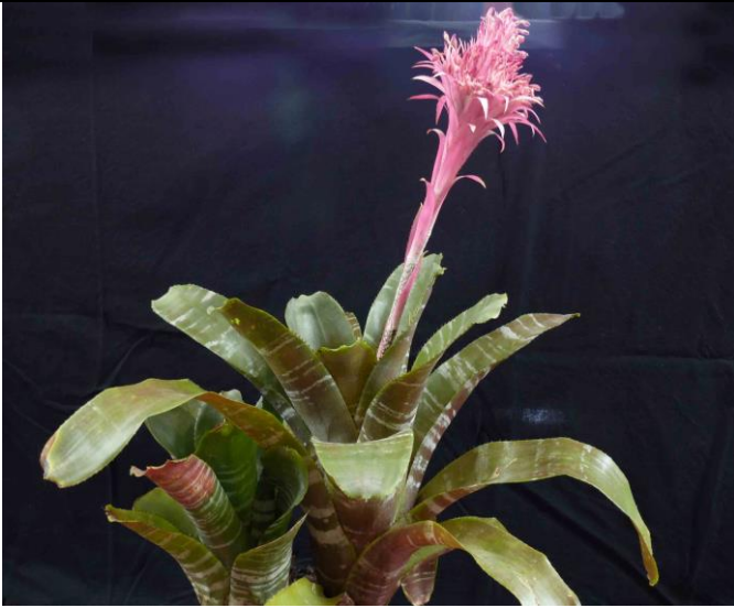
Aechmea fasciata NOT ‘Kiwi’