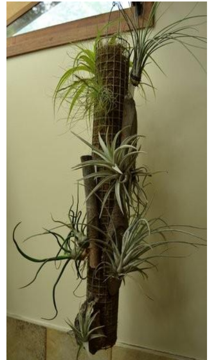
Trevor's long thingie with attached many tillandsias