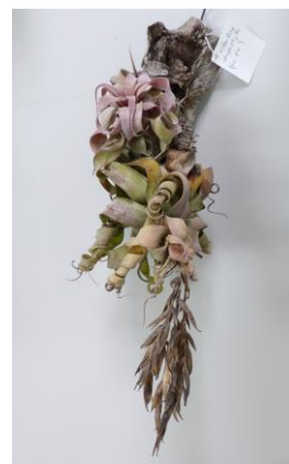
T. streptophylla

The purist in me says it is better to have the same species if doing a multiple planting but I was proved wrong by the artistic ones. On the artistic side there was a mounted T. streptophylla where the ancient rather tatty 'mother' was allowed to remain together with coloured leaved offset.