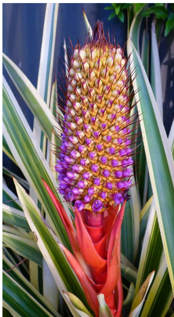
Aechmea 'Nationalis Marginated'

(Previously known as Aechmea ornata var. nationalis )