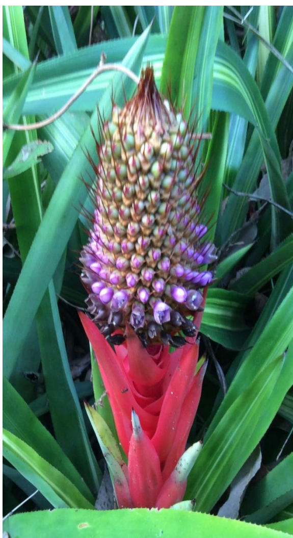
Aechmea 'Nationalis Median'

(Previously known as Aechmea ornata var. nationalis )