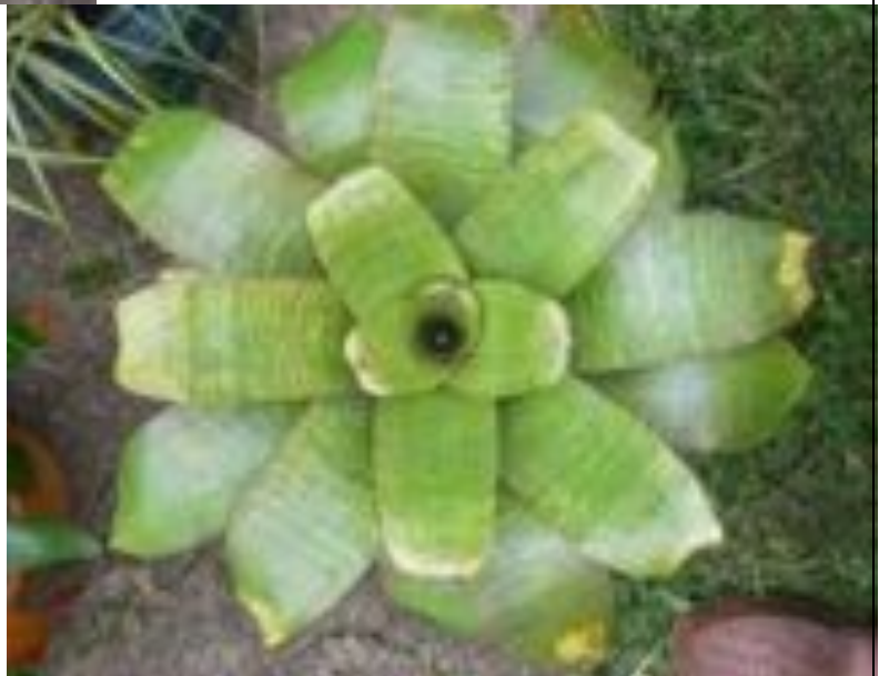
2nd: Pat Pennell with Vriesea Fosteriana CV - Red Dragon