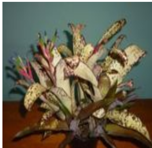
Billbergia ‘Jenny’s Delight’