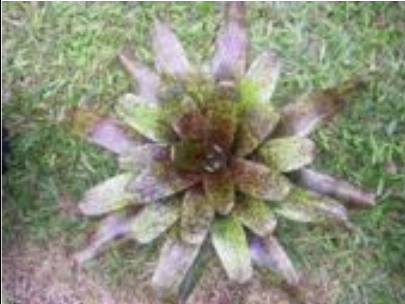
2nd: Len Waite with Neoregelia Hailstorm