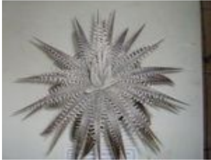
1st Sheryl Waite with Dyckia Dark Moon