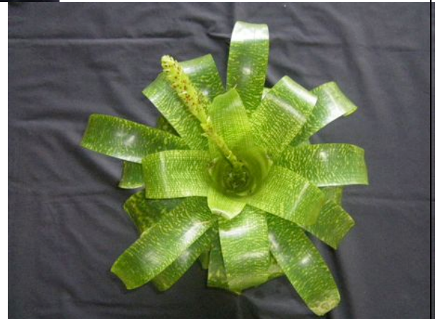
3 rd Pat Pennell's Vriesea Fenestralis