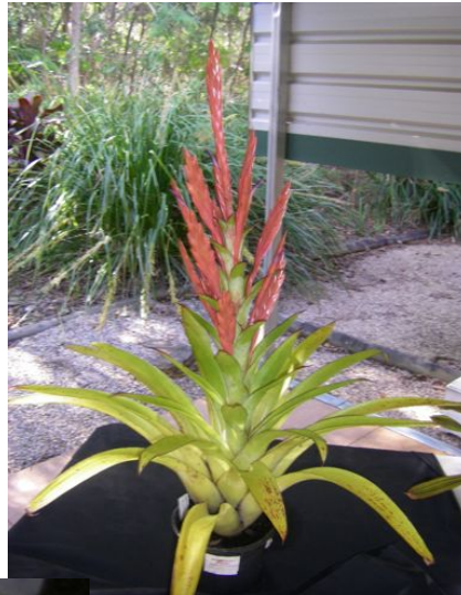
1 st Vanessa Palarski's Tillandsia deppera sp