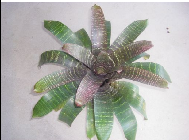
2 nd Pat Pennell's Vriesea Speckles