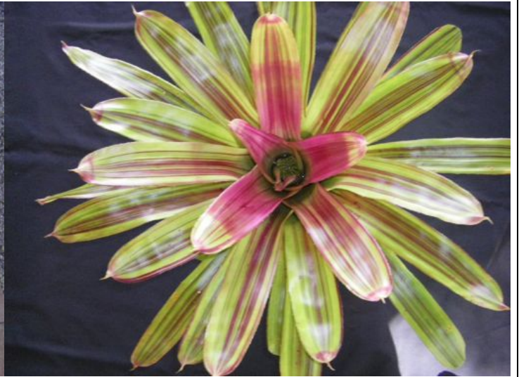
2 nd Lou Baker's Neoregelia Amazing Grace