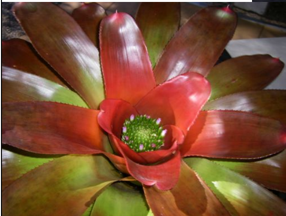
2 nd Ardie Baker's Neoregelia Proud Beauty