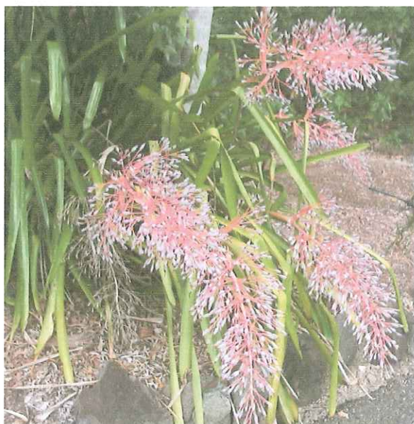
Portea petropolitana var extensa in Alma Park Zoo, Brisbane

When in flower, a clump of this plant is a striking sight in any garden.