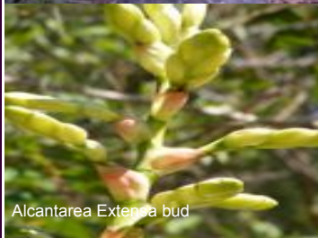
Alcantarea Extensa bud