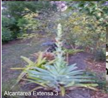
Alcantarea Extensa 3