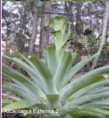
Alcantarea Extensa 2