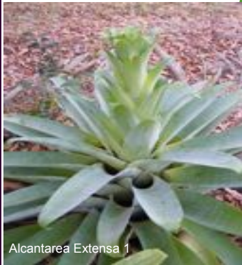
Alcantarea Extensa 1

Pat Pennell kindly took the time to photograph the progressive stages of her Alcantarea Extensa and Neoregelia cruenta X marmorata coming into flower and share them with the members. Also included are photos of some of the many bromeliads Pat and husband Keith have growing at their property