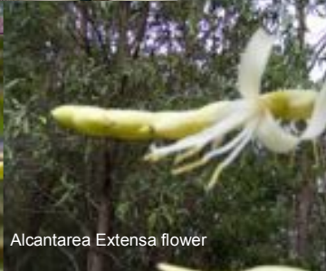
Alcantarea Extensa flower