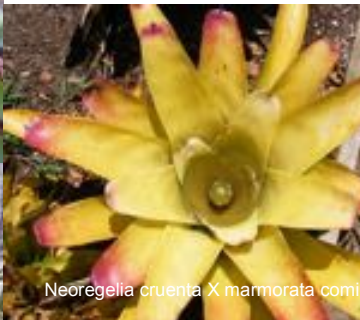
Neoregelia cruenta X marmorata coming into flower