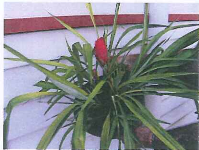
3rd Len Waite's Pitcairnia smithiorum