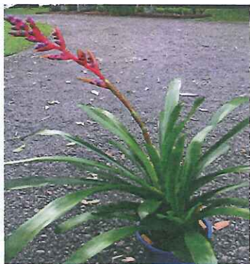
3rd Lou Barker's Aechmea weilbachii