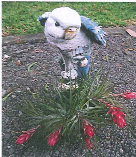
1st Len and Sheryl Waite's Tillandsia display