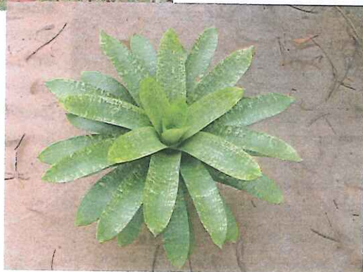
Vriesea 'Nova' hybrid