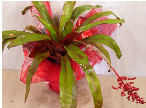
'Great Balls of Fire' shown by Dave Boudier