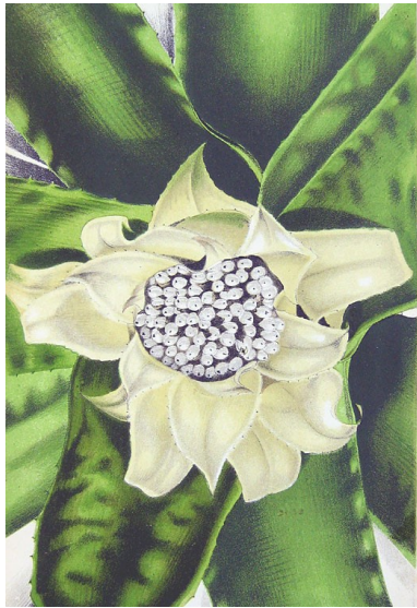
La Belgique horticole, 1879, pl. 308 CANISTRUM EBURNEUM. Brasil, Serra chaude