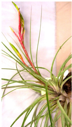
Till. fasciculata var. uncispica Coral McAteer