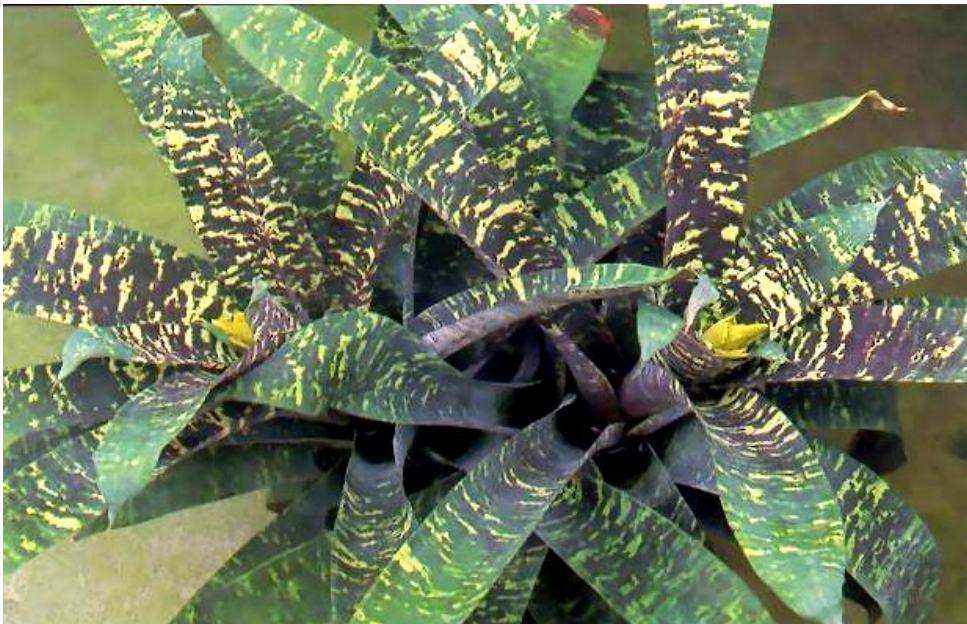
Vriesea ospinae var. gruberi . A clone of the type collection in early bud. Note the broad, distinctly marked, lingulate leaf blades.

A var. ospinae Luther, cui similis, laminis foliorum latoribus et loratis vel lanceolatis (non triangulatis) et tessellatis castaneis (non atroviridibus) differt.