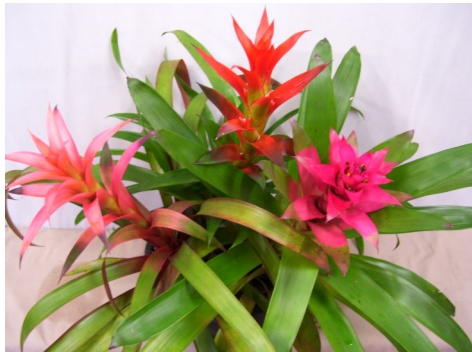
'Guz Heaven' shown by Keryn Simpson