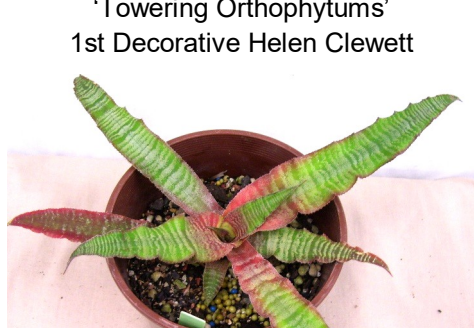
Cryptanthus 'Cheerful' grown by Les Higgins