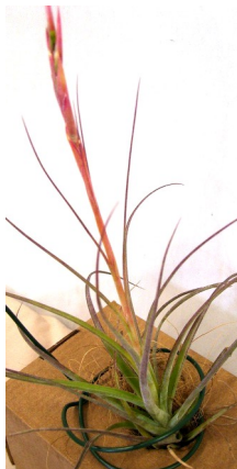
Till. 'Moonlight' Sue Mackay- Davidson