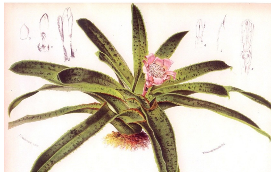
La Belgique horticole, 1883, pl. XIV - XV CANISTRUM ROSEUM. Brasil, Serra chaude

Reitz's criteria were discarded here because, though very logical from an horticultural point of view, they are decidedly artificial. The colour gradation of the involucral and primary bracts, from yellowish to whitish to green, falls within a very narrow range of chromatic variation, so