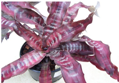
Cryptanthus 'Crazy Moon' shown by John Crawford