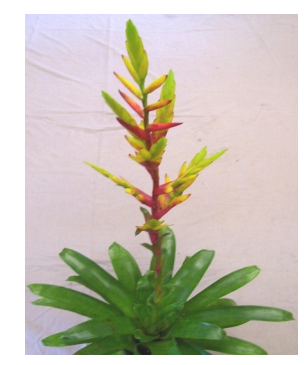
Vriesea 'Pyjamas' (unreg)