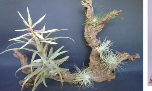
Tillandsia's on driftwood