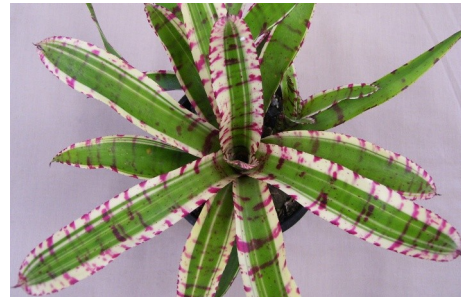
Neoregelia 'Groucho' showing marginated variegation and zonation