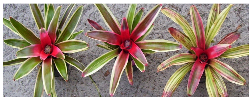
Neo. 'Gift'Neo. 'April' (unreg)Neo. 'Dreamtime'Neo. group showing difference in colour and variegation that often get confused.