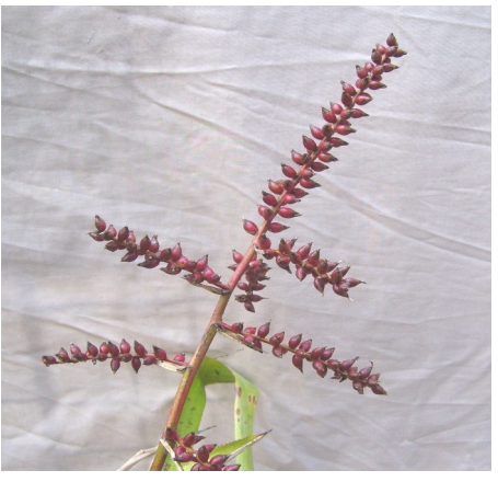
Aechmea burle-marxii with fresh inflorescence and older orange/red berries