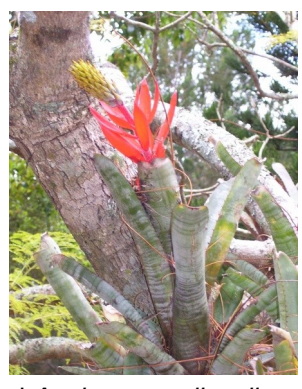
Aechmea caudata, Aechmea gamosepala var. nivea and Aechmea nudicaulis showing some springtime colour