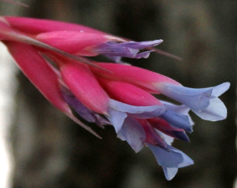
Tillandsia aeranthos clump also a close-up of a inflorescence.