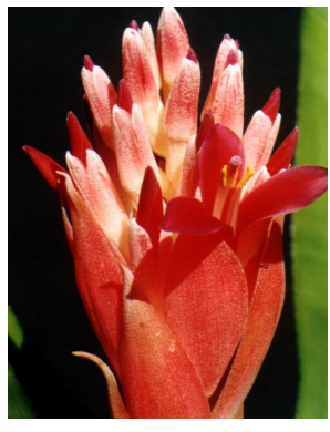
Billbergia pyramidalis var. pyramidalis