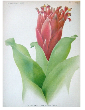
Billbergia pyramidalis as thyrsoidea