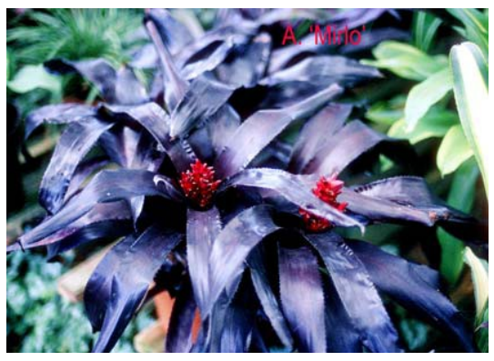
Ae. 'Mirlo' (?) 1984