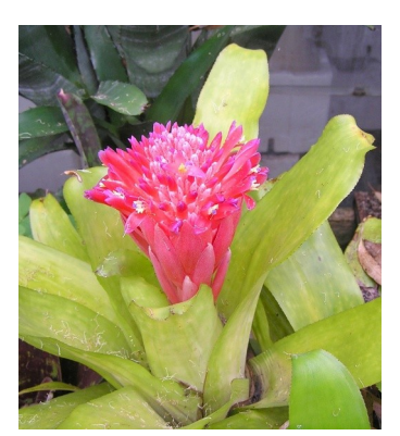
Billbergia pyramidalis as concolor