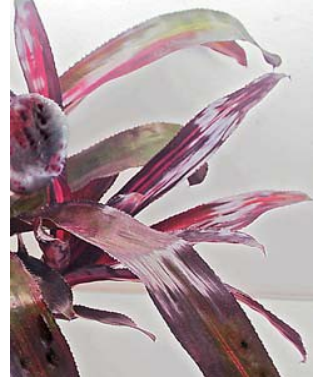
Ae. 'Mirlo' pup Herb Plever