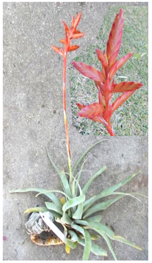
Tillandsia latifolia var. divaricata and close-up of inflorescence