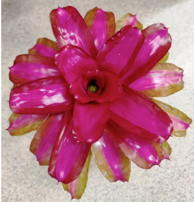
Neoregelia 'Pink on the Inside'