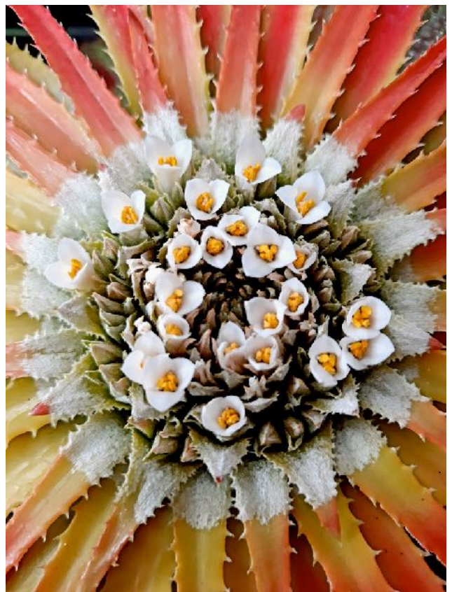
Sincoraea albopicta - flowered on Sunday ^