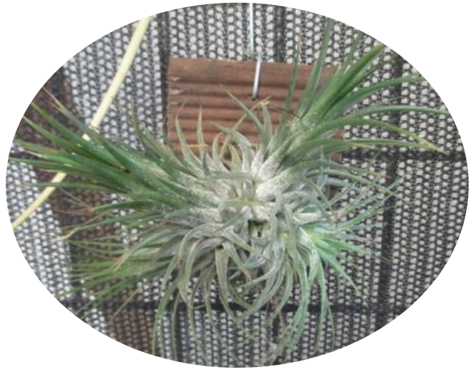
Bob's Tillandsia tricholepis