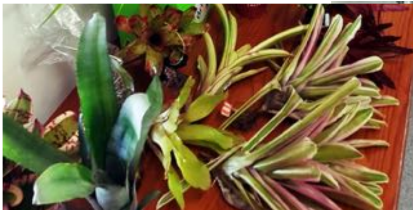
Raffle Table Goodies