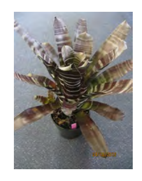
ADVANCED Len Waite—Aechmea Black Zombie