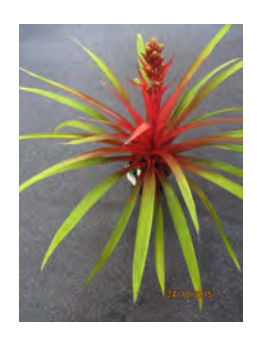
NOVICE Jules Grange — Guzmania blassii