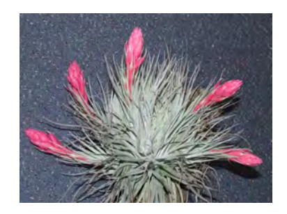
INTERMEDIATE Bernie Polzin—Tillandsia 'Houston'