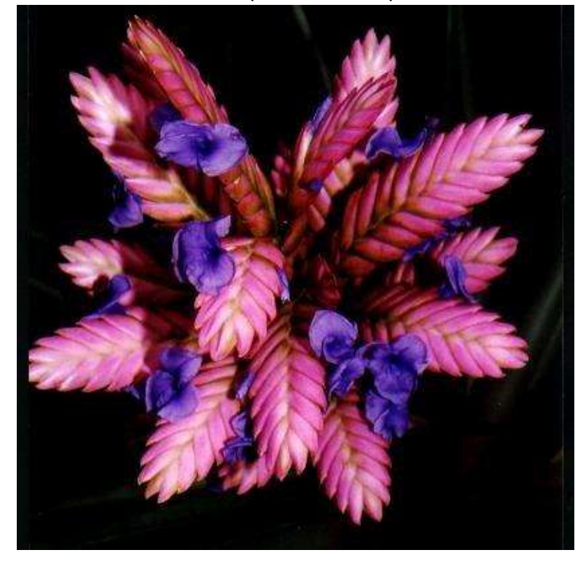
September winner – Bernie Polzin Tillandsia Creation