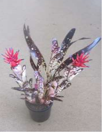
Billbergia 'Live Wire'