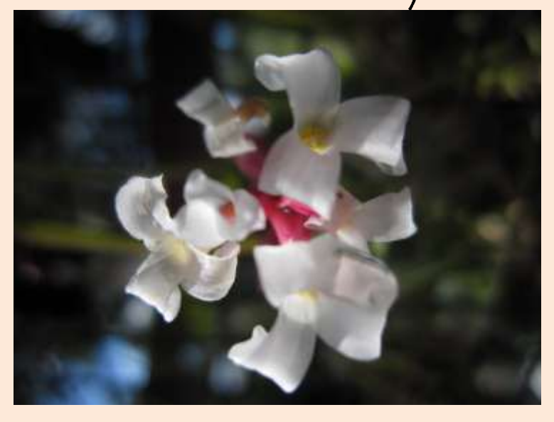
Tillandsia correia araujoi