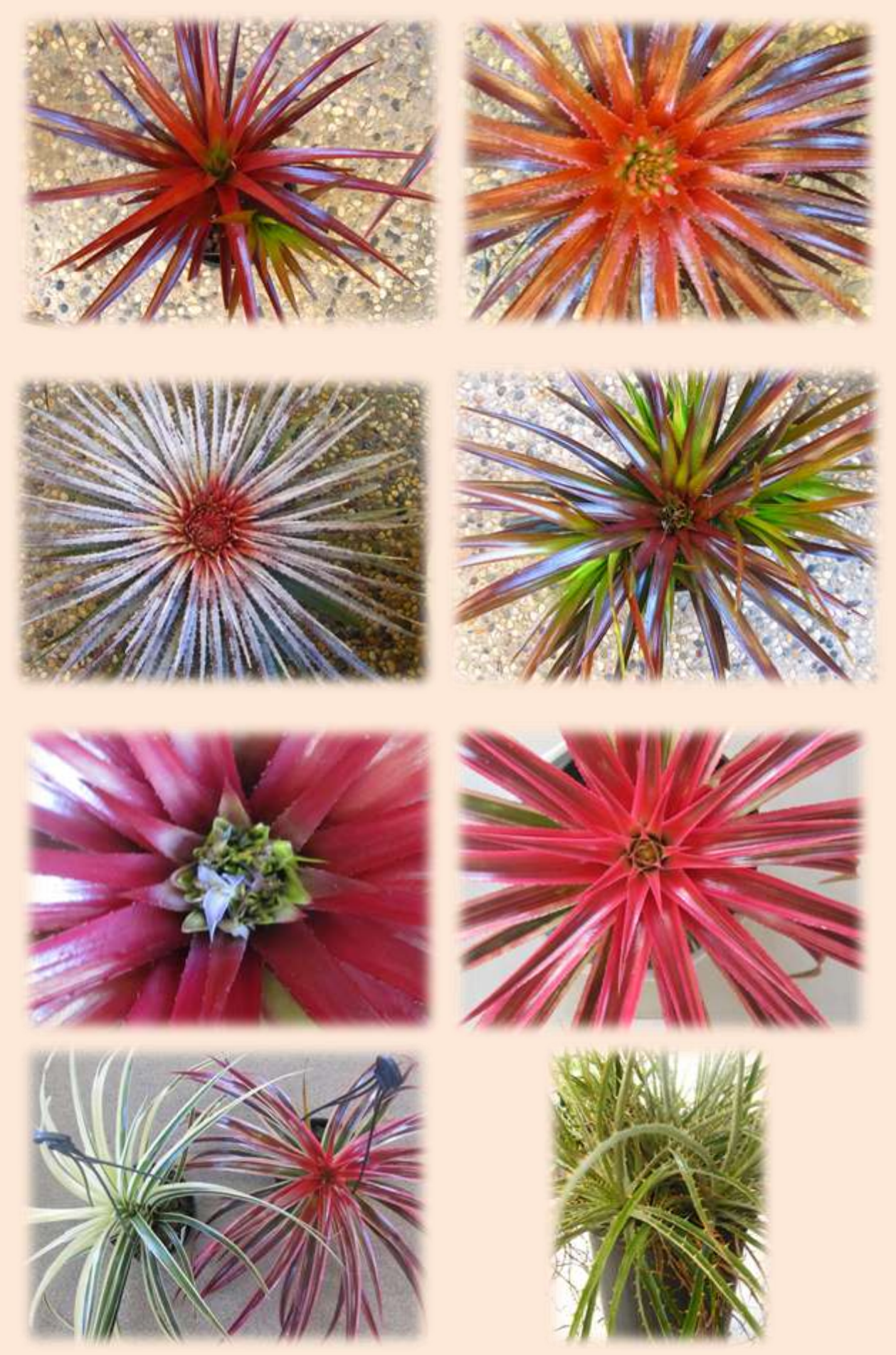
Orthophytums and xNeophytums – beautiful!