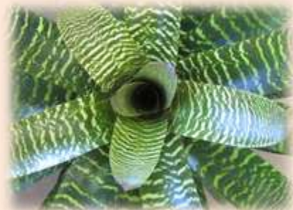
Vriesea Montezum'a Gem