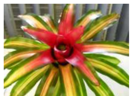
Neoregelia tricolor 'Perfector'