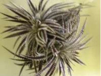
Dyckia 'White Chocolate'