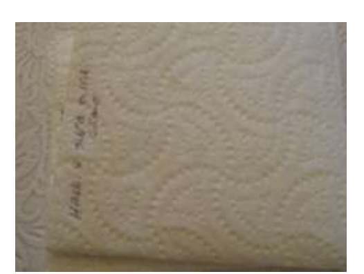
Have absorbent paper prepared with the name of the seed written on it.