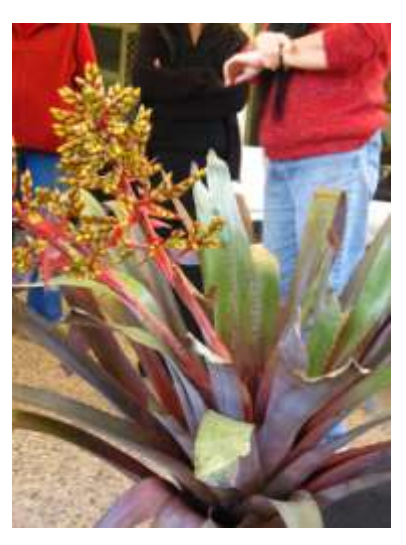
Ever seen this before? Len has a plant that has produced 2 spikes from the centre of 1 plant.