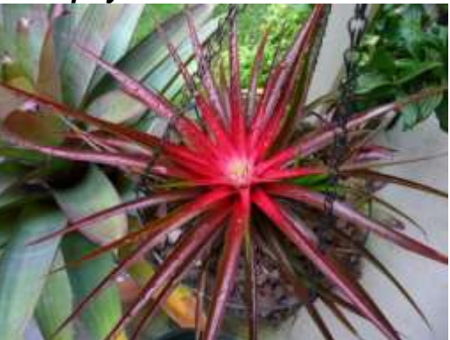
xNeophytum 'Gary Hendrix'