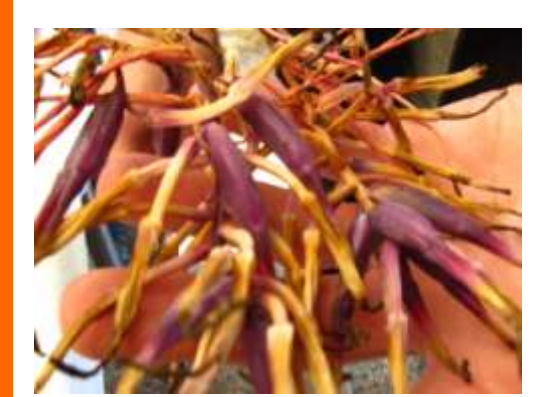
First collect the seed from the flower spike. The plump red ones!