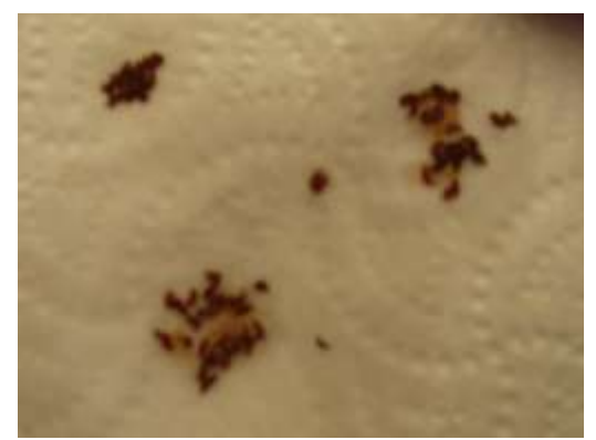
Pour off excess water and put seed onto paper. Put in safe place to dry out.

Use seed immediately or store dried seed in an envelope to be used later.