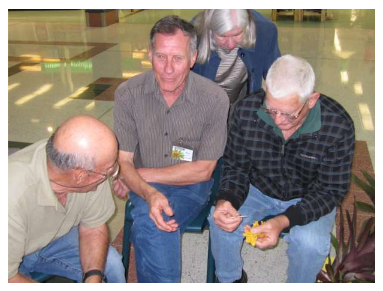
At the Morayfield Shopping Centre interest was in - hybridising orchids!