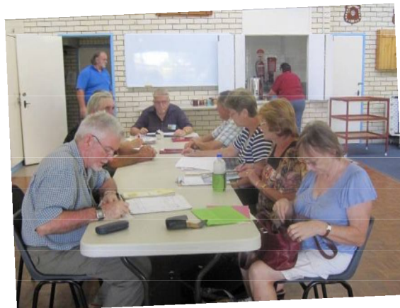
Our committee and stewards at work