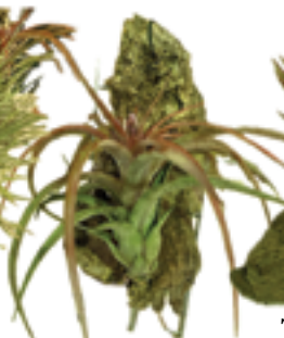
Tillandsia 'Eric Knoblock'