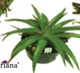
Neoregelia 'Hot Embers'