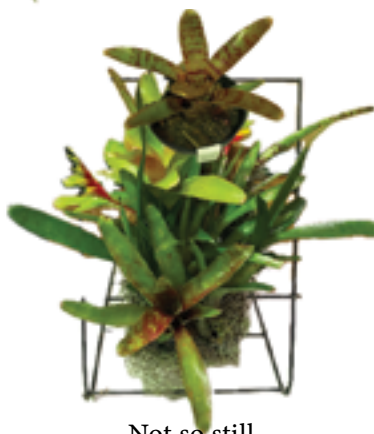
Not so still