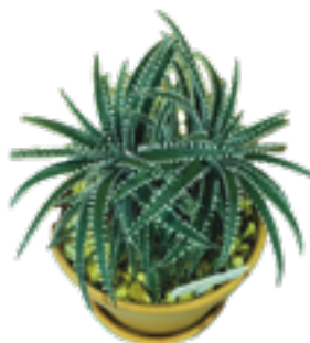
Dyckia 'Talbot Hybrid'