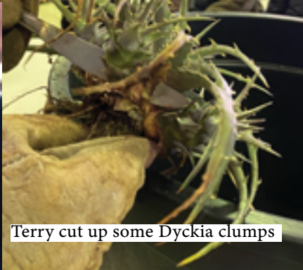
Terry cut up some Dyckia clumps