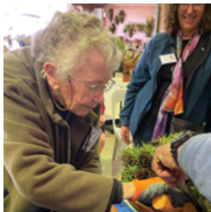
Warril cut up a huge Deutaconia clumps