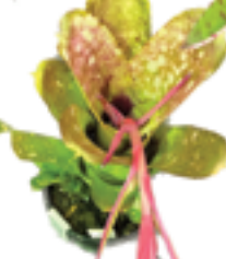
Billbergia 'Talbot Crescent Moon'