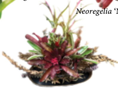
'It's nearly Spring'