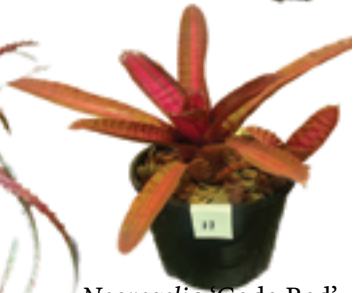
Neoregelia 'Code Red' Aechmea 'Blue Bonnet'