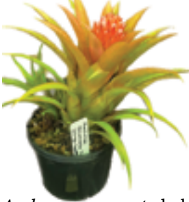
Aechmea recurvata hybrid