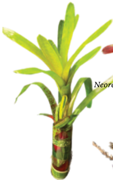
'Brom leaf tower'