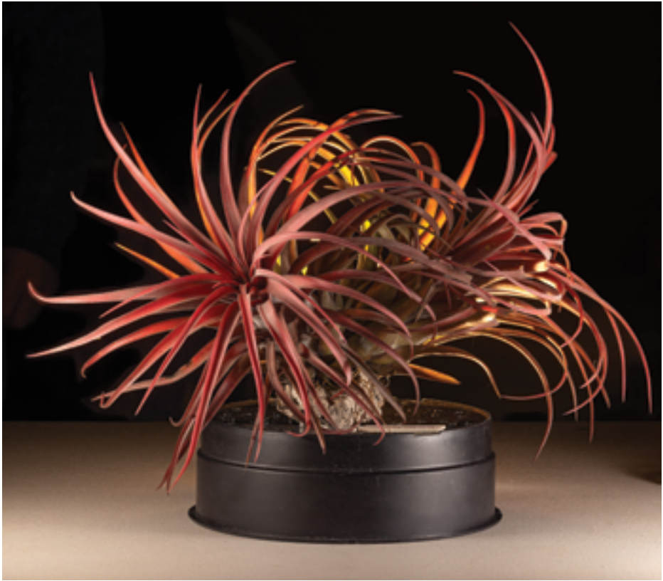
Photograph by Glenn Smith of Carolyn Bunnell's Tillandsia "Eric the Red"

Camera set up - Cannon EOS R5 Mirrorless full frame with 100mm macro lens and two small lightboxes. The plant is lit from the front and behind to highlight the back leaves and add depth to the image.