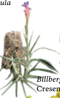
Tillandsia aeranthos v. aemula