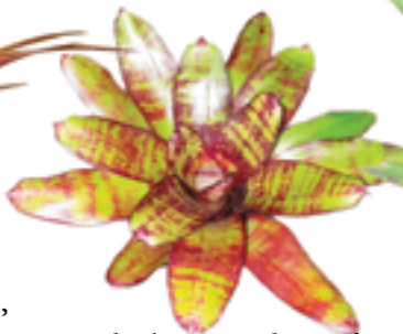
Neoregelia 'Diamond Mine'