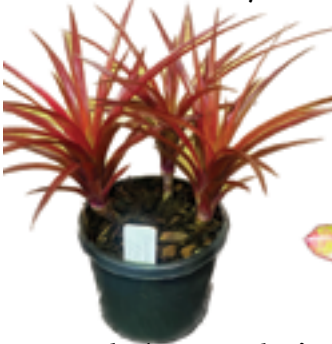
Sincoregelia 'Fire Cracker'