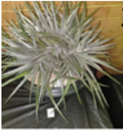
Tillandsia 'Pink Sugar'