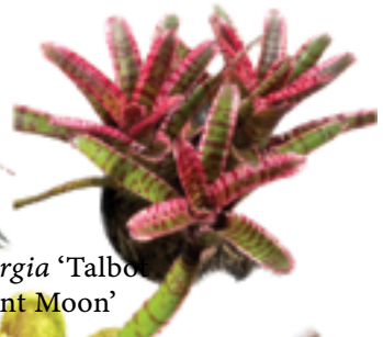
Billbergia 'Talbot Crescent Moon'