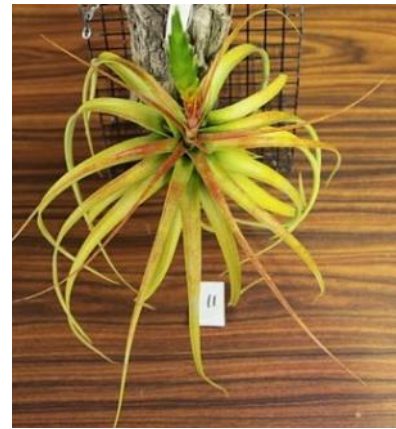
Clockwise left to right: Till. leomaniana; Neo. Prinsler; Till. Roland-grossolinii; 'Under the Tree', 'Nudie'