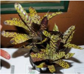
Ae. correa-araujo dark form