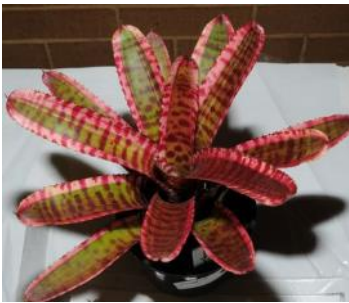
Neoregelia 'Blushing Zebra'