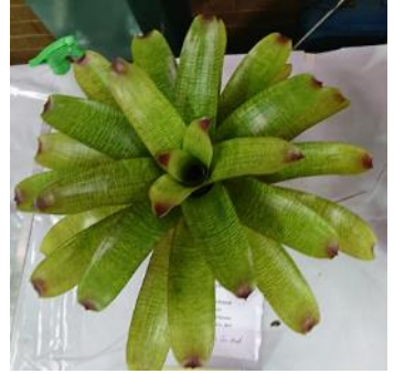
Vriesea hieroglyphica x platynema