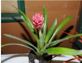
Ae. disticantha var. glaziovii