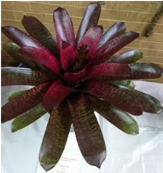
Vriesea 'Purple Panther'