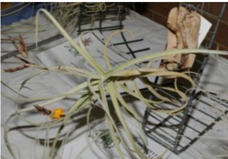
Tillandsia crocata x duratii