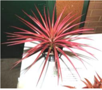
xSincoregelia 'Cosmic Blast'