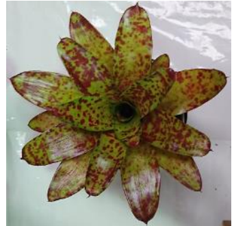
Neoregelia 'Big O'