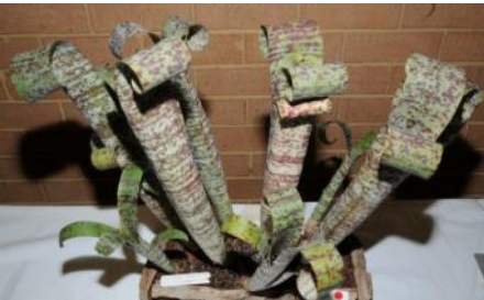
Quesnelia 'Tim Plowman'