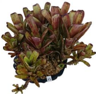
Aechmea nudicaulis variety