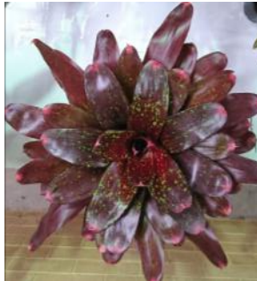
Neoregelia marmorata hybrid