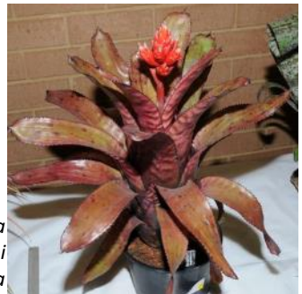
Quesnelia edmundoi var. rubrobracteata