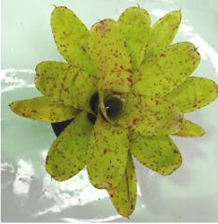
Neoregelia 'Lillipet' No11