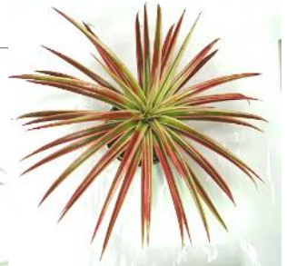
Xincoregelia 'Galactic Warrior'