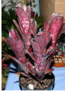
Billbergia 'Grand Finale'