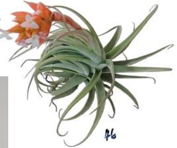
T. recurvifolia var subsecundefolia