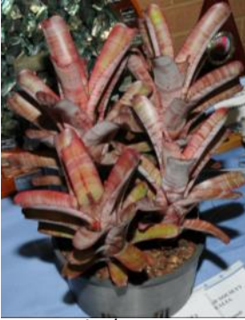
Aechmea nudicaulis var aequalis