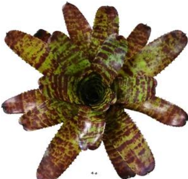
Neoregelia Tiger Head