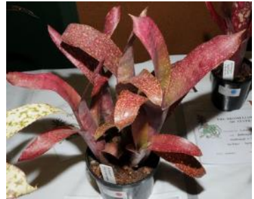
Billbergia 'Pink Champagne'