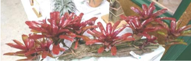
Eoregelia 'Purple Grape'