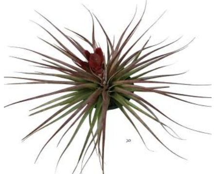
Tillandsia rothii x concolor