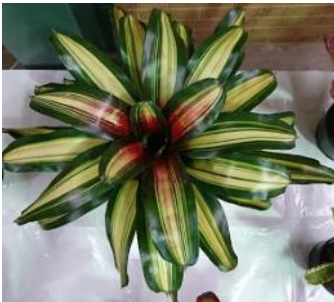
Neoregelia 'Kahala Dawn'