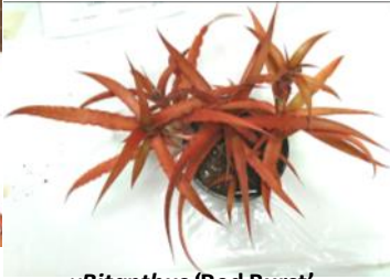
xBitanthus 'Red Burst'