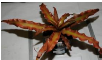
Cryptanthus 'Blood Red'