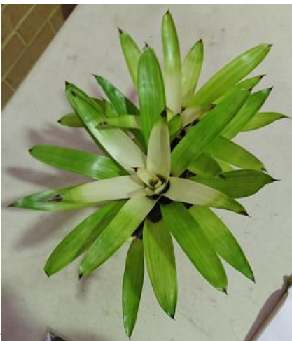
Vriesea 'White Cloud'