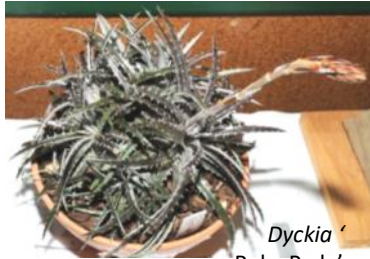
Dyckia 'Ruby Ryde'