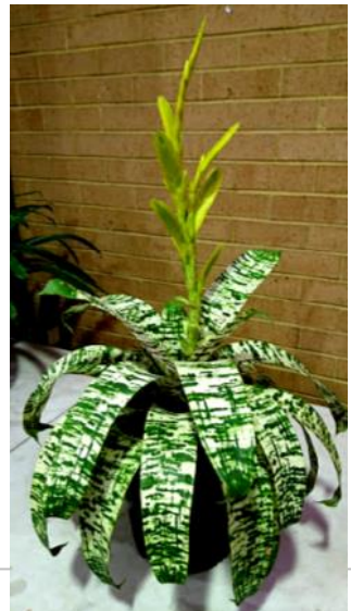
Goudaea 'Sons of Tiger Tim'