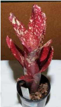
Billbergia 'Hallelujah' x 'Golden Joy'