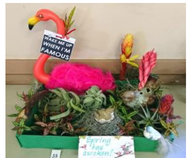
'Spring has Awoken'