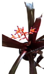
Right: possibly Aechmea 'Red Wine', 'Hummel's Red', or 'Vin Rose'