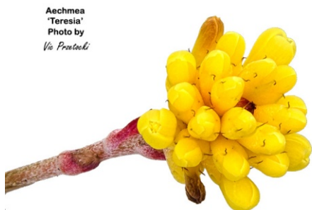
Aechmea 'Teresia'

We know that this variegated Aechmea calyculata is being grown in Brazil, the USA, and Australia. So that it can be recorded in the Bromeliad Cultivar Register I am proposing to register it as Aechmea 'Teresia'.