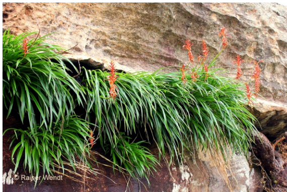
Pitcairnia feliciana in a rock face. Mont Gangan, Guinea, West Africa

Pitcairnia feliciana was found growing near Kindia, Guinea, West Africa. The plant is grass-like in appearance. It has a bulbous base, and narrow leaves that only have spines at their base. The plant forms large clumps about 50 cm high. At flowering, it has an unbranched (simple) spike, about 20 cm long. Its flowers have yellow petals. A more comprehensive description is given in Rauh (1970), which can be borrowed from the Society's library.