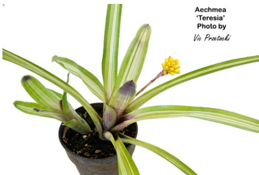
Aechmea 'Teresia'

In recent years we have seen variegated plants going out of fashion by most botanists because they are a mutation and cannot be replicated by seed. So this particular variegated plant is treated as with the type in 'The World Check list of Selected plant families' maintained by Kew Gardens and not being recorded in 'Ref flora' maintained by the Brazilians.