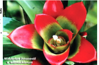
Nidularium innocentii (previously named Nidularium innocentii v. paxianum )

Nidularium innocentii var. wittmackianum was common in New Zealand, as a light green, thin-leaved largish plant with red bracts and white flowers, and it seemed sensible to rename it Nidularium longiflorum . So far so good. However as it turned out, the plant we knew as innocentii var. wittmackianum was not the same as the true innocentii var. wittmackianum and was far from being the same as Nidularium longiflorum . What we had called innocentii var. wittmackianum was just another Nidularium innocentii var. innocentii .