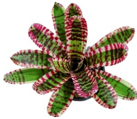
Neoregelia 'Wild Rabbit'