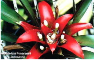
Nidularium innocentii v. innocentii