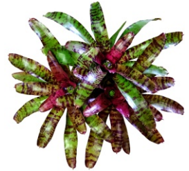
Neoregelia 'Gympie Delight'