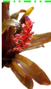
Left: Aechmea 'Foster's Favorite'

While Pitcairnia feliciana is of no particular horticultural significance, its African location guarantees the plant a place in bromeliad history!.