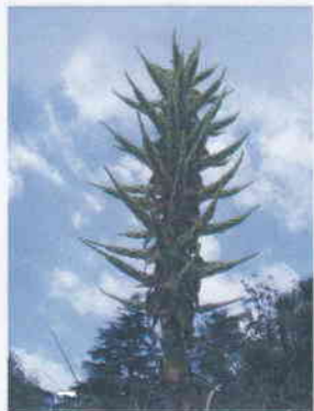
Still to open