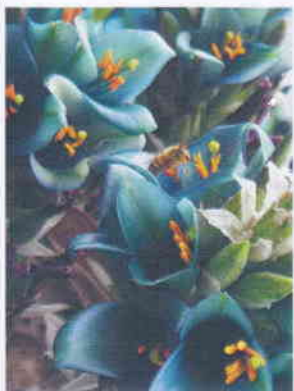
Bee for scale.