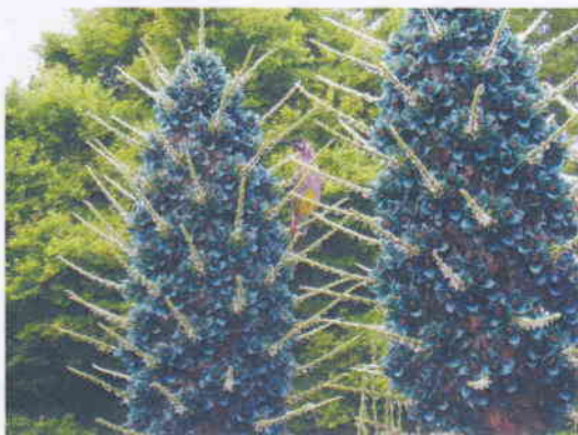
Bird for scale