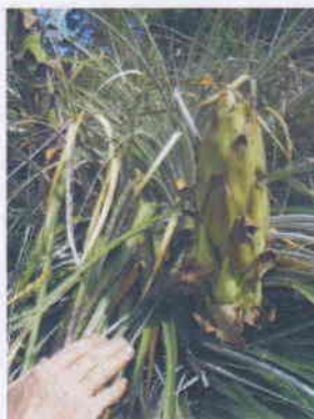
Forming a stalk