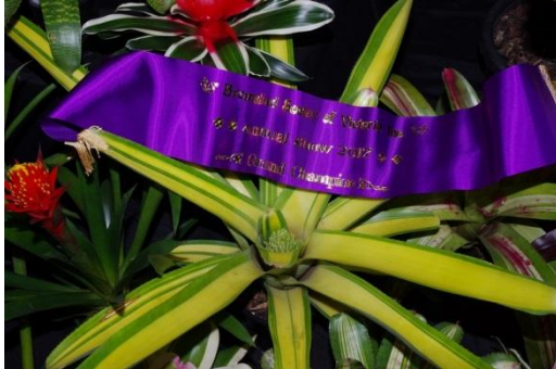
Grand Champion – Neoregelia 'Goldilocks' Gwenda Eleftheriou