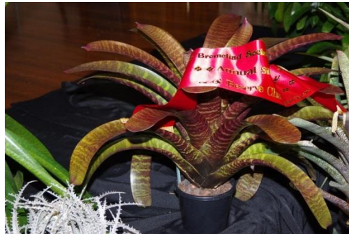
Reserve Champion – Vriesea 'Red Emperor' Keely Ough